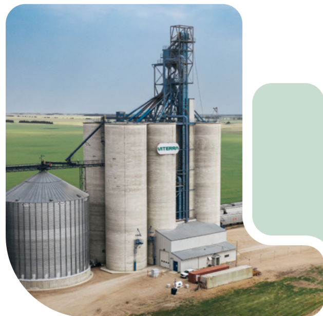
Valparaiso storage and handling facility, Saskatchewan, Canada

We are tremendously excited at the opportunity that Gavilon brings to Viterra, diversifying our earnings and geographic reach. We are also pleased to gain the knowledge and talent of Gavilon's people, who will undoubtedly further enhance our global team.